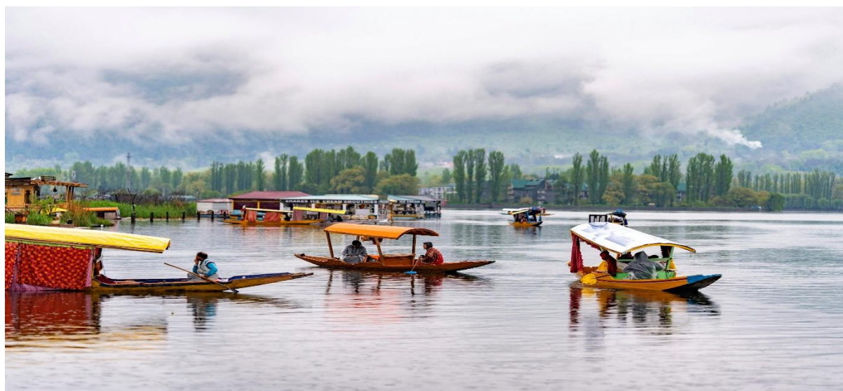
Figure 1.2 View of Dal Lake, Srinagar